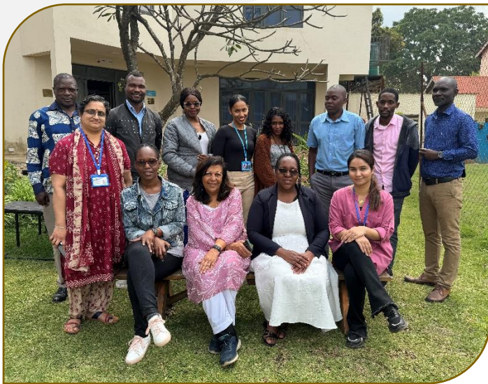
- NISA TEAM - 2024/2025 ACADEMIC YEAR