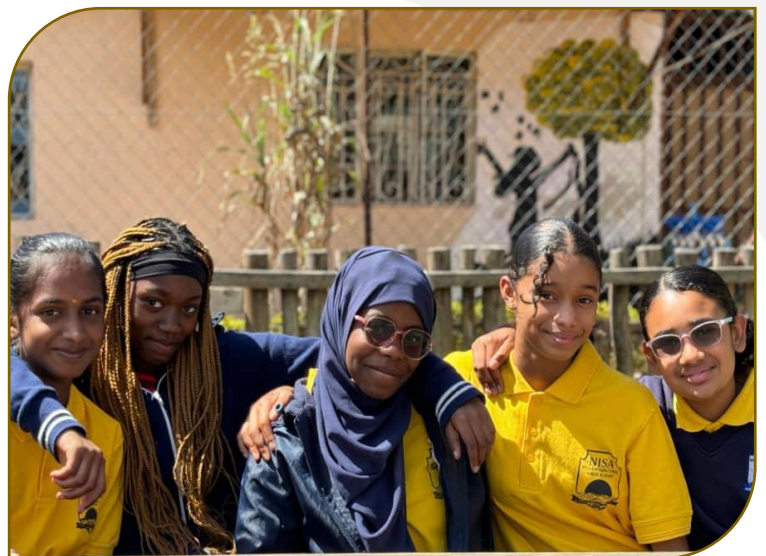
- NISA STUDENTS - LOWER SECONDARY