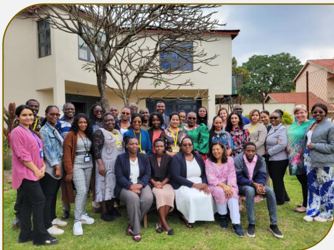
- NIA TEAM - 2024/2025 ACADEMIC YEAR